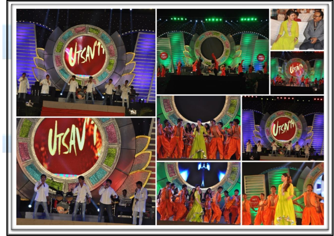
Students' Performances at UTSAV'14