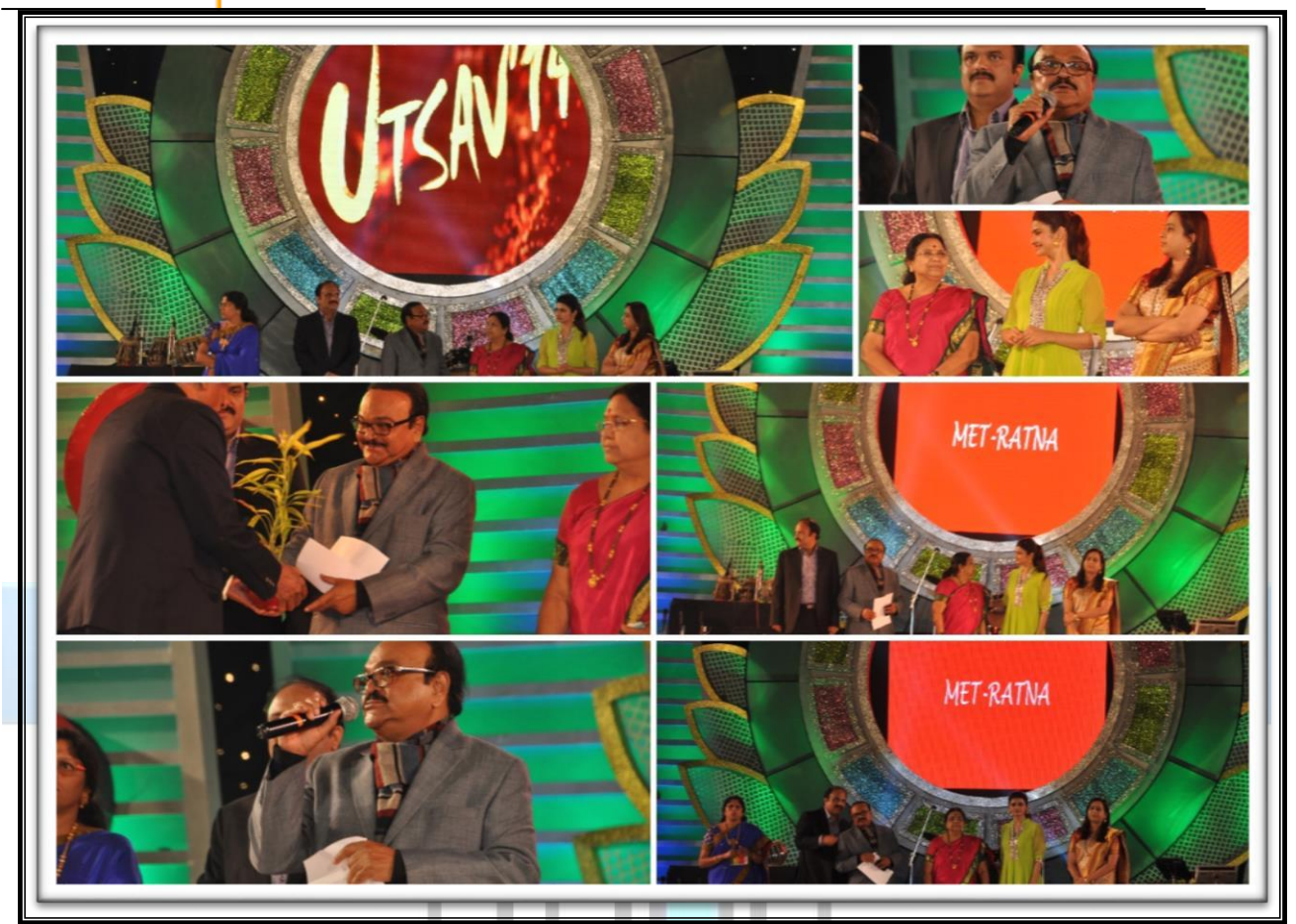
MET RATNA Awards Distribution