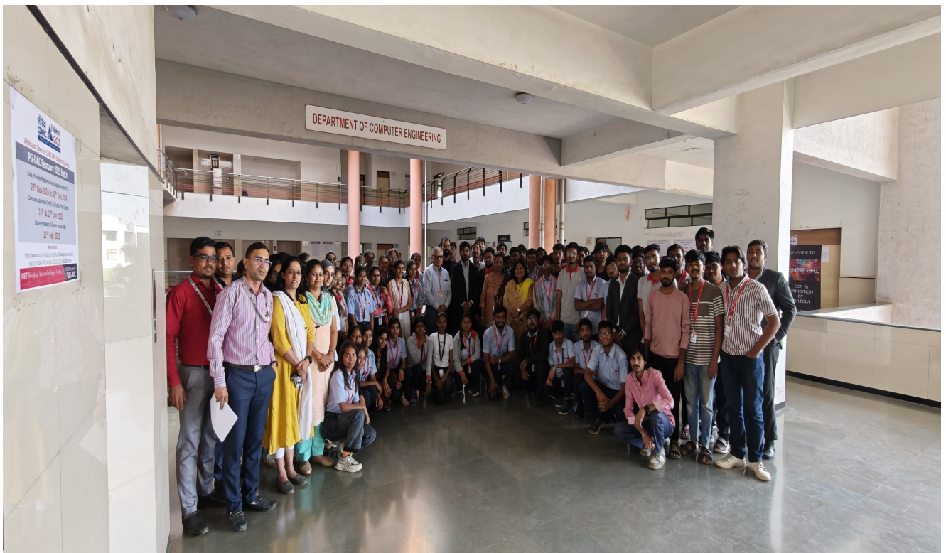
MET's Bhujbal Knowledge City, IOE Department of Information Technology