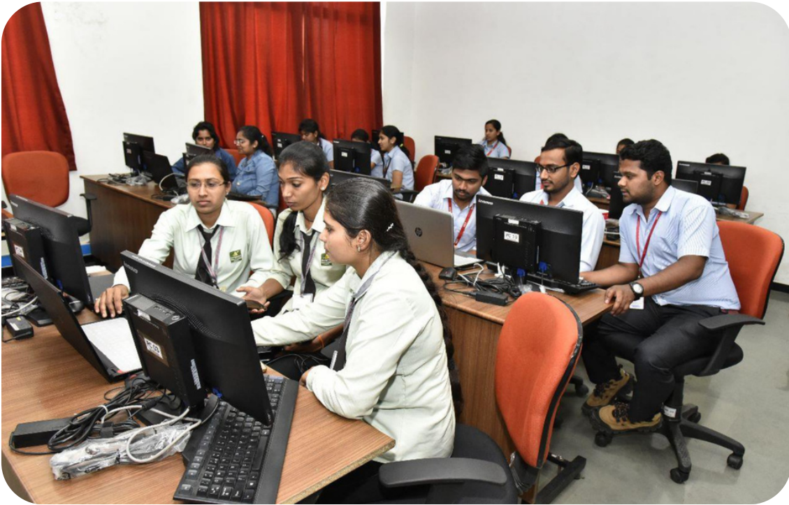
Event CodeRunner Ignite-2019