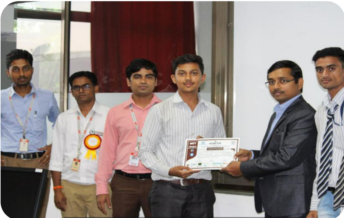
Event Placement Practices Ignite-2019