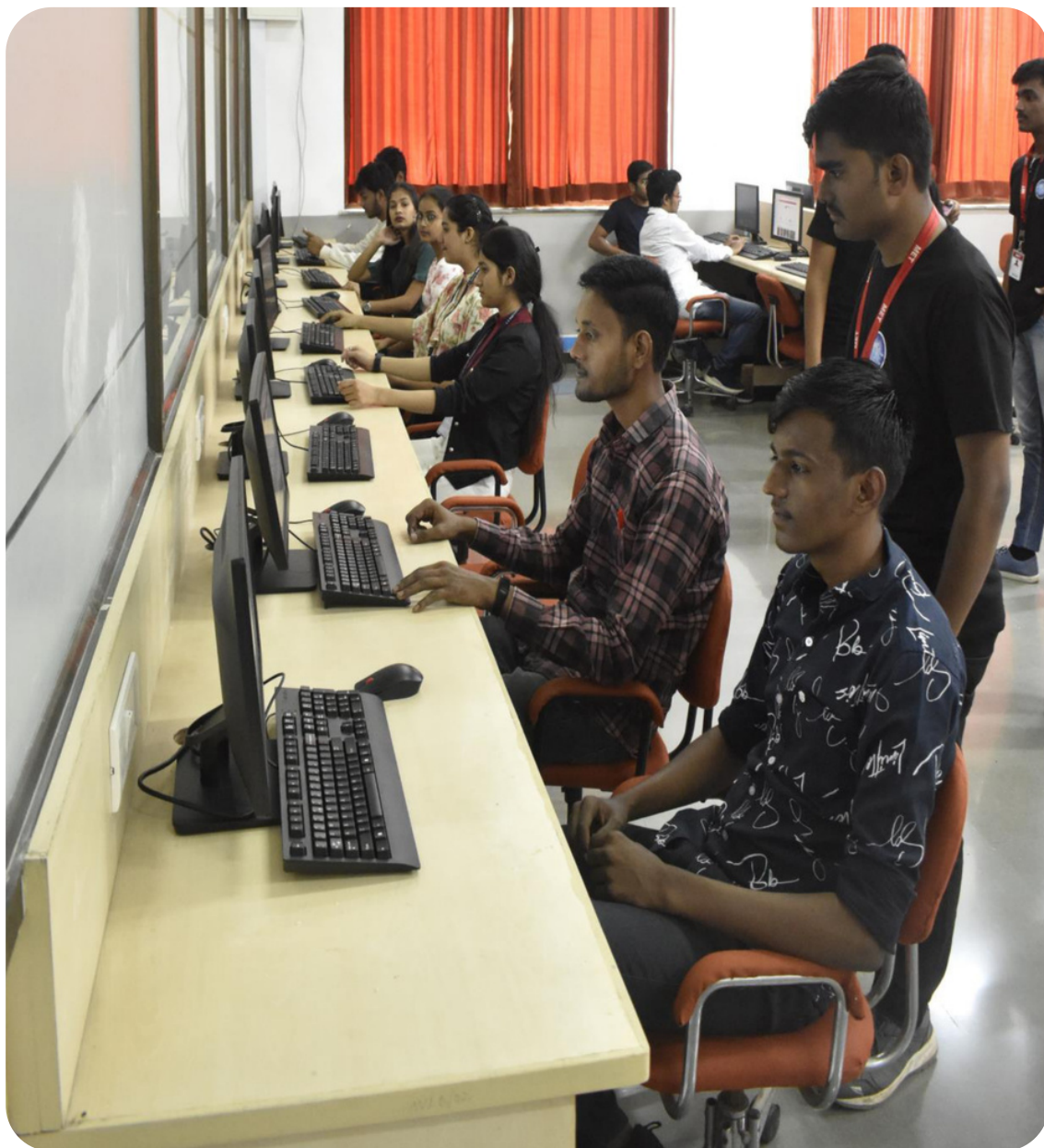
Event TechnoPanther Inginte-2017