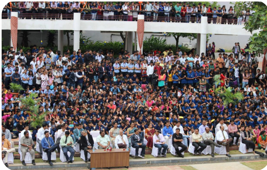
Inauguration Ceremony of Engineers Week 2017