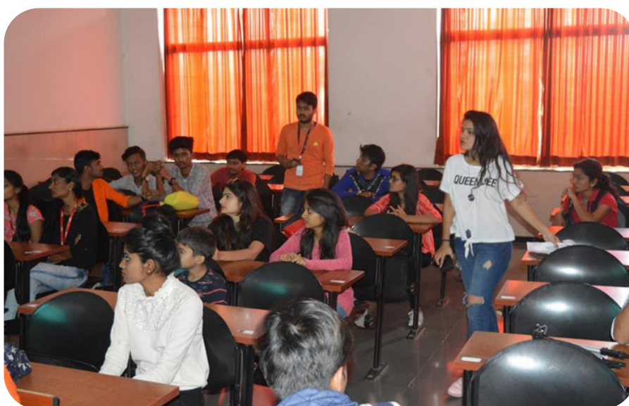
Best friends forever event Ignite-2017