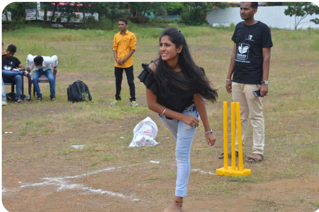
Ballout Event Ignite-2017