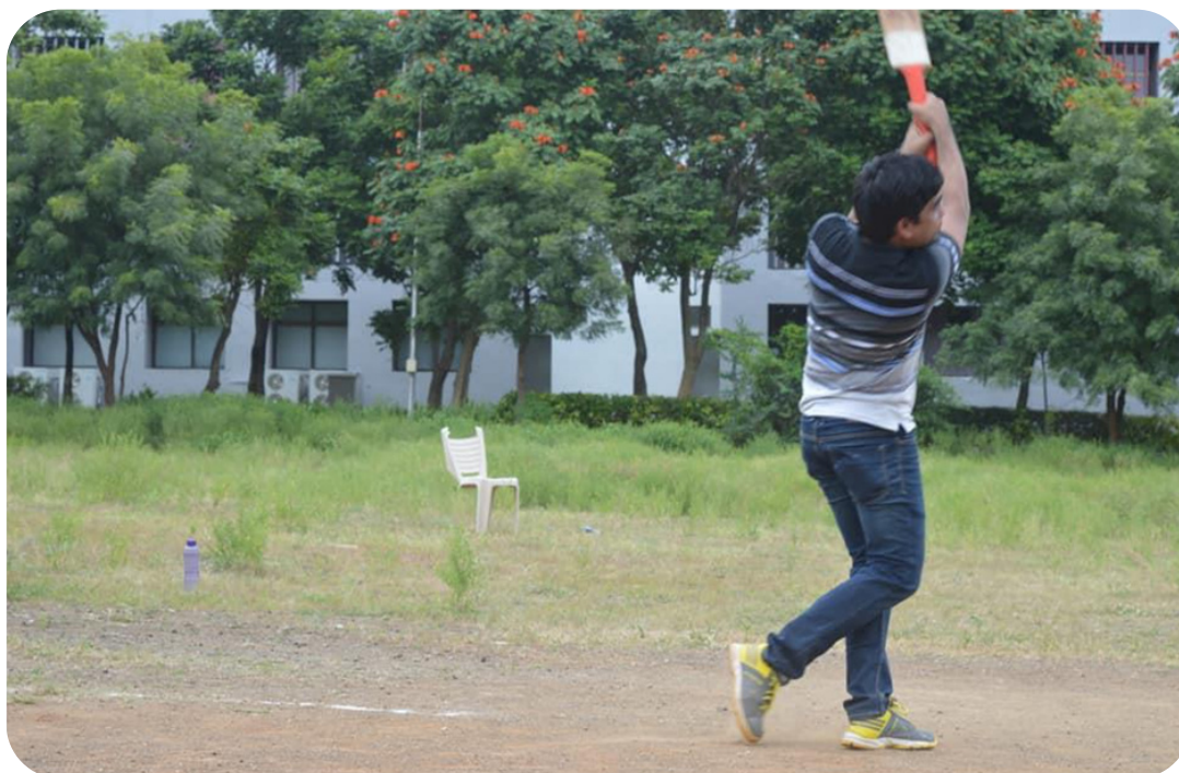
Ballout Event Ignite-2017