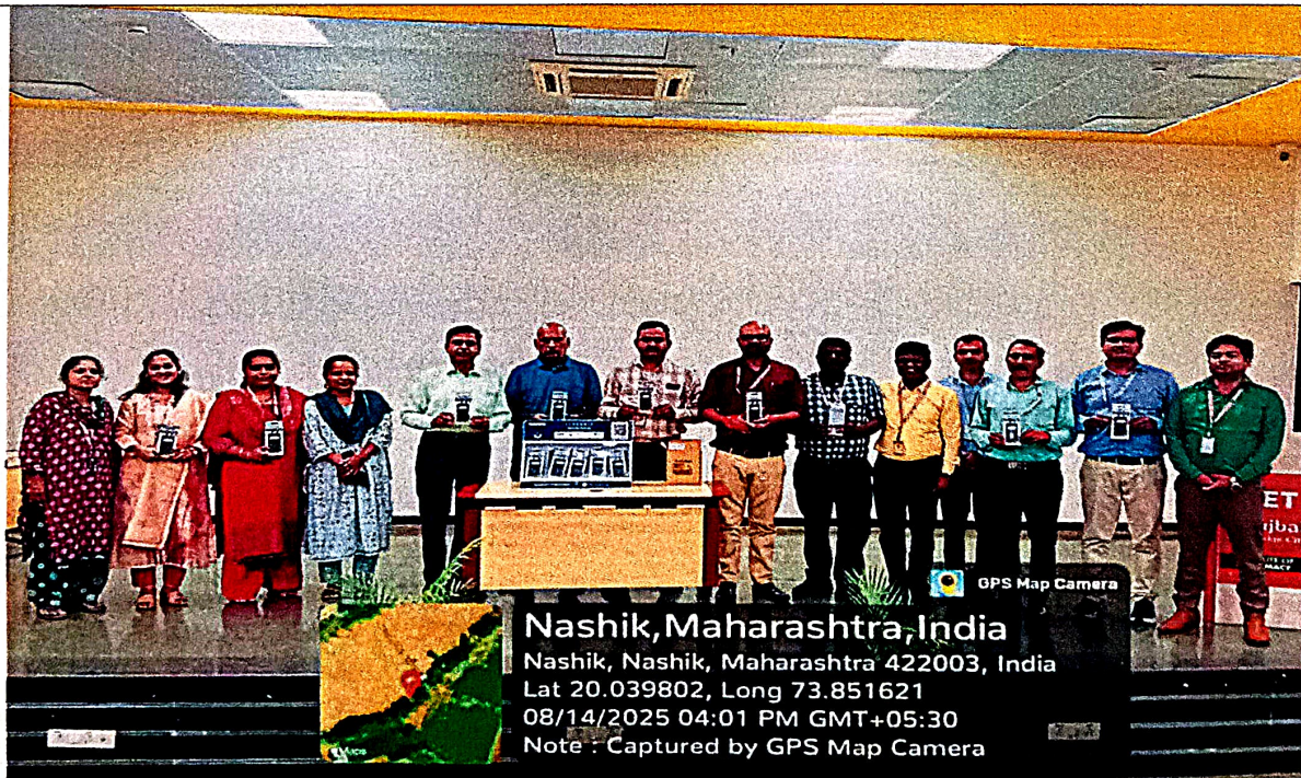
All Teaching & Non Teaching Faculty with resource person