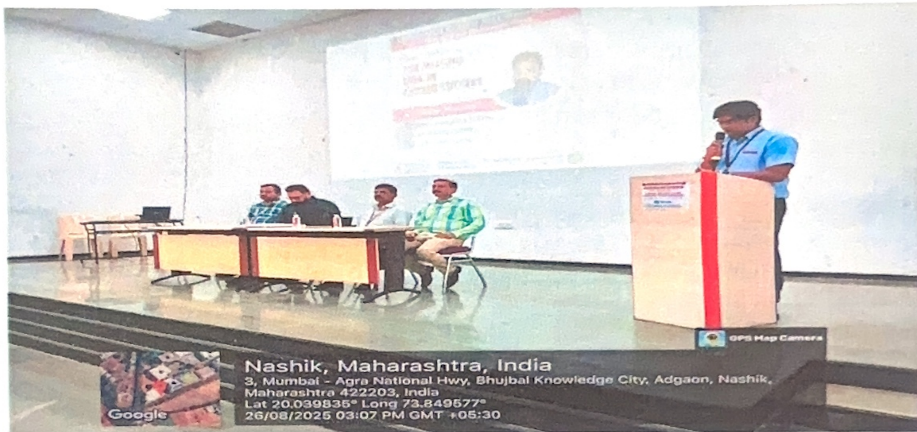
Introduction of Programme