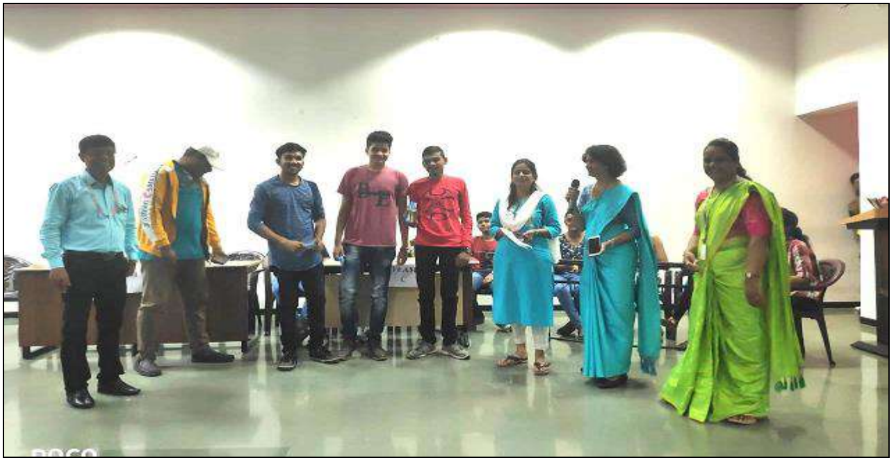
❖ Tree Plantation