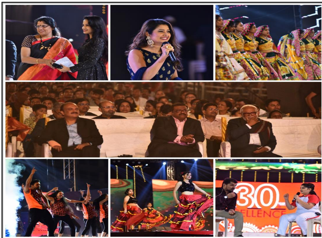
Glimpses of Grand Cultural Night of UTSAV 2019 – Chief Guests & Performances

A Grand Finale rather a Grand Cultural Night hosted by MET BKC for all the students and staff to showcase their cultural talent like Singing, Dancing, Mimicry, Drama, Anchoring, Instrument Playing etc. On the occasion of UTSAV this grand night is arranged every year on the last day of UTSAV. This night gets acknowledged by various talented, versatile personalities from Cinemas to name some of them are Mrs. Prajakta Mali, Mrs. Ketaki Mategaonkar, etc. and many more Bollywood personalities. This year we invited one of the celebrity from Marathi Industry. Every year MET BKC invites such great personalities of Bollywood and that is main attraction of the cultural night.