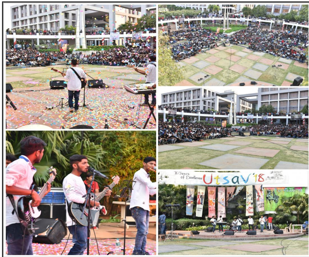
Rock Show during UTSAV'19

It was an awesome event for everyone and yes of course one of the talk of the MET shows called ROCK SHOW. Where we use to invite various bands from in and around nashik and provided a platform to showcase their talent and to entertain the people at fullest. Every year UTSAV celebrates youth with ROCK SHOW. This year we invited a local amazing bands from nashik region to perform in front of MET people A huge crowd has witnessed the event with more enthusiasm. This was the in-house activity held at Amphitheater on 17 th Jan 2019 .