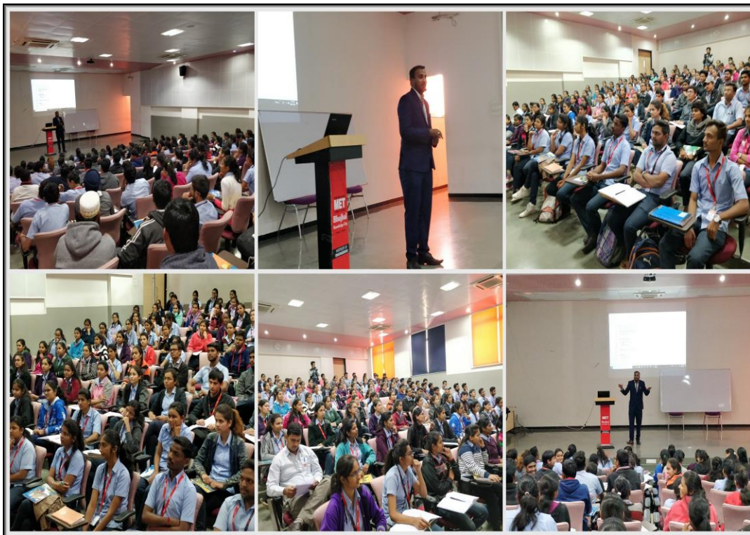
Students Attending STTP on Advanced Data Structures & Speaker Addressing them at IOE SEMINAR HALL

The Short Term Training Program was organized by all the students of Computer Department during 8 th – 11 th January 2019. It has focused on brush-up session on Basics of C++ and Data Structures and afterwards the speaker has delivered the basic to in-depth knowledge about the Advanced Data Structures available, their structures, real time use and how to efficiently implement them using C++ to achieve the solutions for real time problems. The speaker in the last day told about how important data structures are in Software development and how it provides the strong foundation for development of various algorithms.