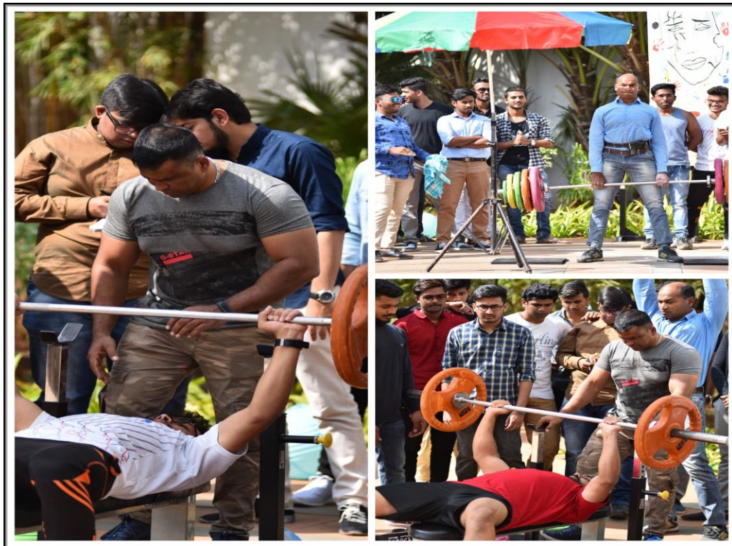
Power Lifting Workshop during UTSAV 2018