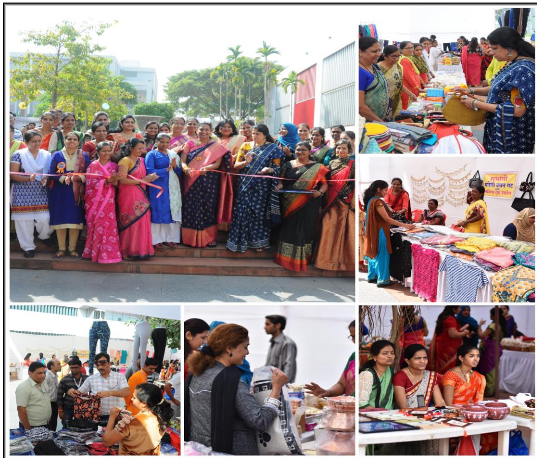
Fun Fair during UTSAV'19

This was mainly the Fair like area where we can enjoy food and can purchase various clothes on various stalls hosted by students of all the departments of all the Institutes of METBKC and also can enjoy various small games which were also hosted on stalls by the students. We had also kept the prizes for winners of games. Almost all the students and staff had enjoyed this event a lot.