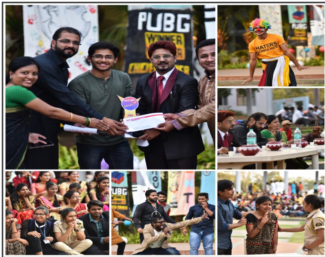
Students' Performing at MET's Got Talent during UTSAV'19