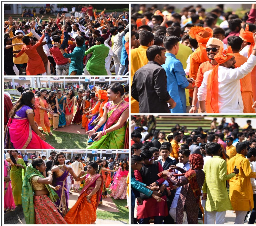
GARBA during UTSAV 2019

It was fun and full of entertainment event for the campus where all the staff and students had actively participated at large. This workshop was based on the techniques of doing GARBA in groups. This is basically the main dance form of Gujrati people who enjoy it during the “Navratri Festival” . Various different techniques were enjoyed by the audience and they executed them with full of their heart. A huge crowd has responded and enjoyed the event to the fullest. It was held on 16 th Jan 2019.