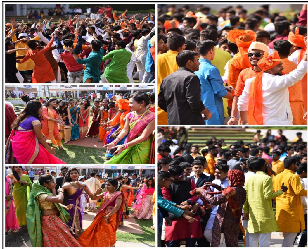
MUSIC WAR during UTSAV'19

A [DJ] music was arranged for all the audience to have fun with free dance style. This event was very enjoyable and enthusiastic for all the youth of the campus. All the students and staff had actively participated and enjoyed the dance floor to fullest with the charming music at all the time.