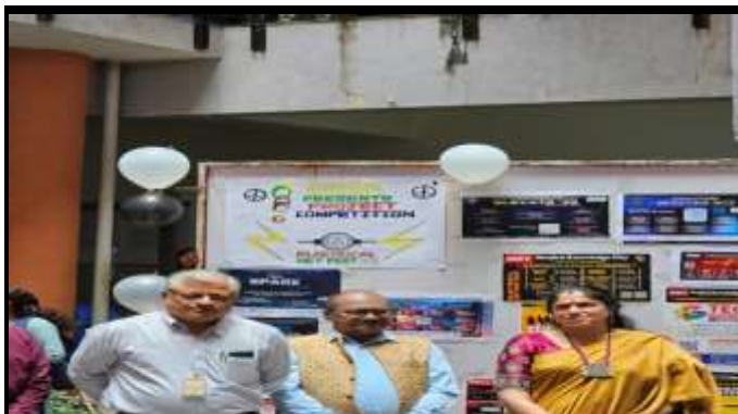
Inauguration of Technical Activities program by Guest and principal sir

A grand event was held for the inauguration of METASTORM '25 on 18 & 19 Sept. 2025. The event was conducted for 2 consecutive days from 18 nd – 19 st Sept. 2025. Many of the sponsors from in and around nashik has enlighten the ceremony with their valuable presence.