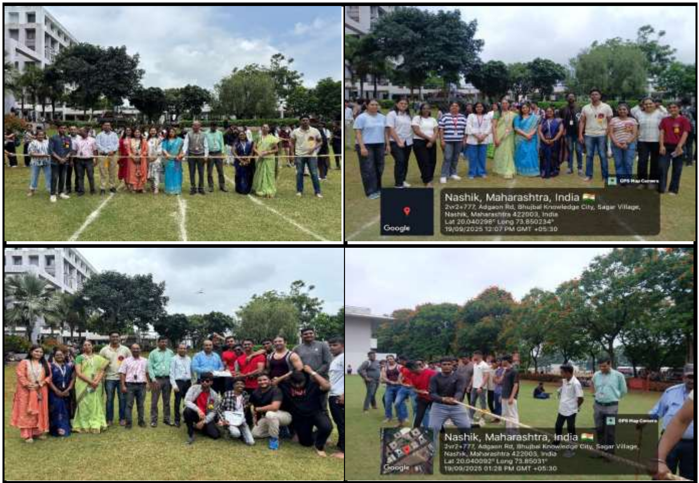
Inauguration of event and Participants with Coordinators at Tug Of War 2025