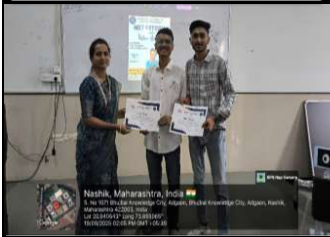
Nashik, Maharashtra, India 3 No 187 Bhukar Knowledge City, Alipara, Bhukar Knowledge City, Alipara, Nashik, Maharashtra 422003, India Lat 20.940912° Long 73.850912° 19/09/2024 02:08 PM GMT +05:30