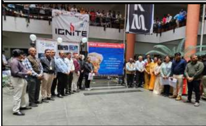
Photo session with principal, all dept. head and guest