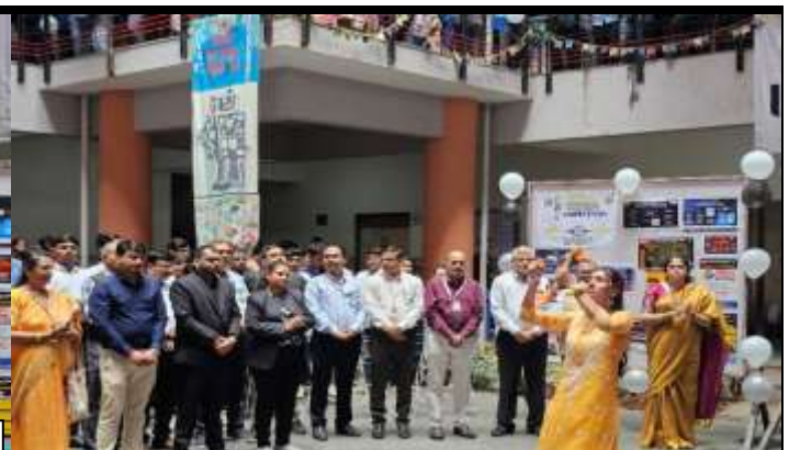
performed Ganesh Vandana by Student