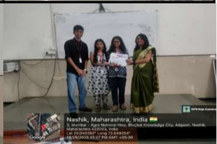
Inauguration of event and Participants at "Brand War 2025" Event