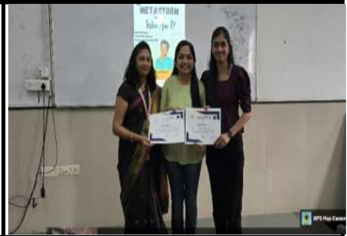
Inauguration of Technical event and Participants at "Who Am I?"