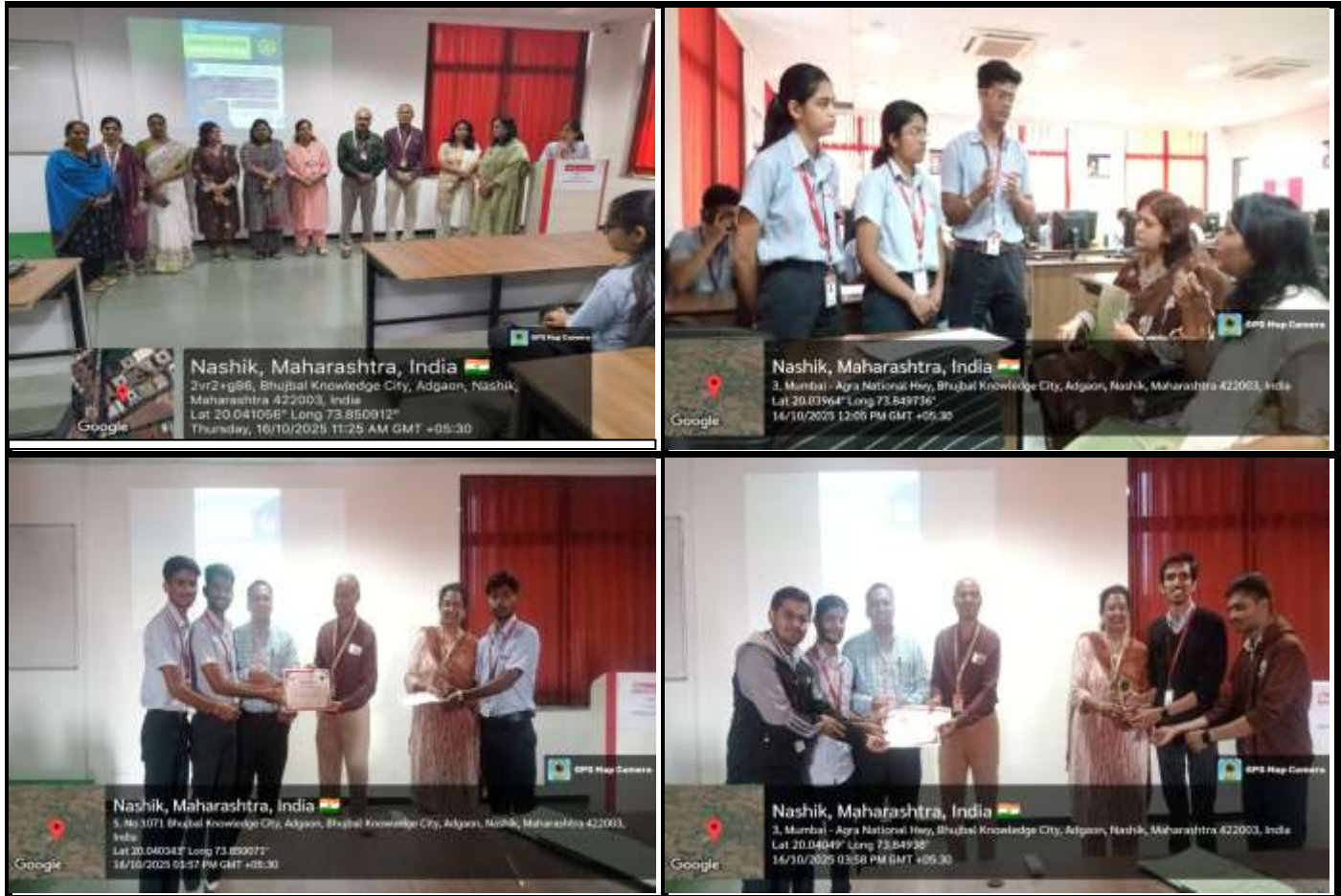
Inauguration of Project Poster Competition Event, Participants & Awarding to Winner-Runner by Judges.