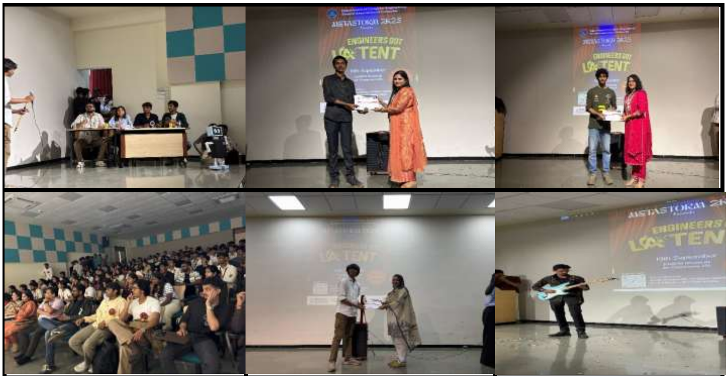
Inauguration of event and Participants with Coordinators at Engineers Got Latent