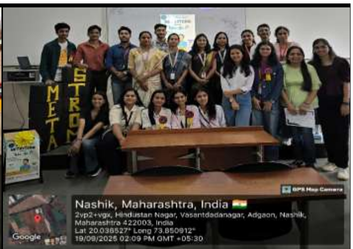
Nashik, Maharashtra, India 2vp2+vgx, Hindustan Nagar, Vasantdadanagar, Adgaon, Nashik, Maharashtra 422003, India Lat 20.036527° Long 73.850912° 19/09/2024 02:09 PM GMT +05:30