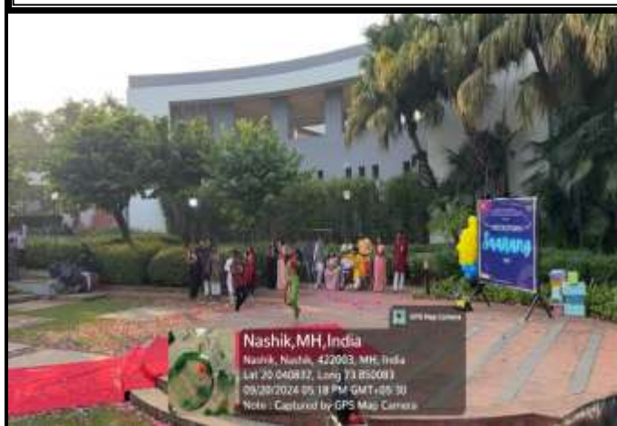
Nashik, MH, India Nashik, Nashik, 422003, MH, India Lat: 20.040832, Long: 73.850091 09/30/2024 05:18 PM GMT+05:30 Note: Captured by GPS Map Camera