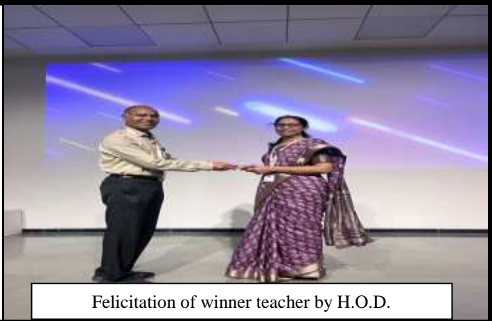
Felicitation of winner teacher by H.O.D.