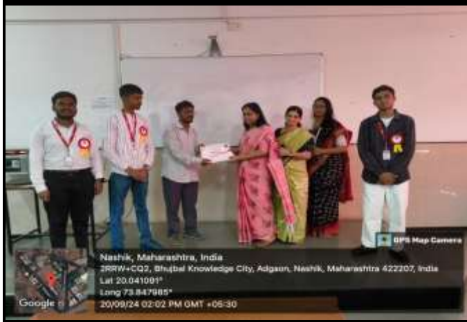
Nashik, Maharashtra, India 3RRW+Q02, Bhujbal Knowledge City, Adgaon, Nashik, Maharashtra 422207, India Lat 20.041091° Long 73.847985° 20/09/24 02:02 PM GMT +05:30