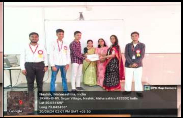
Nashik, Maharashtra, India 28M8+DHW, Sagar Village, Nashik, Maharashtra 422207, India Lat 20.034125° Long 73.842458° 20/09/24 02:01 PM GMT +05:30