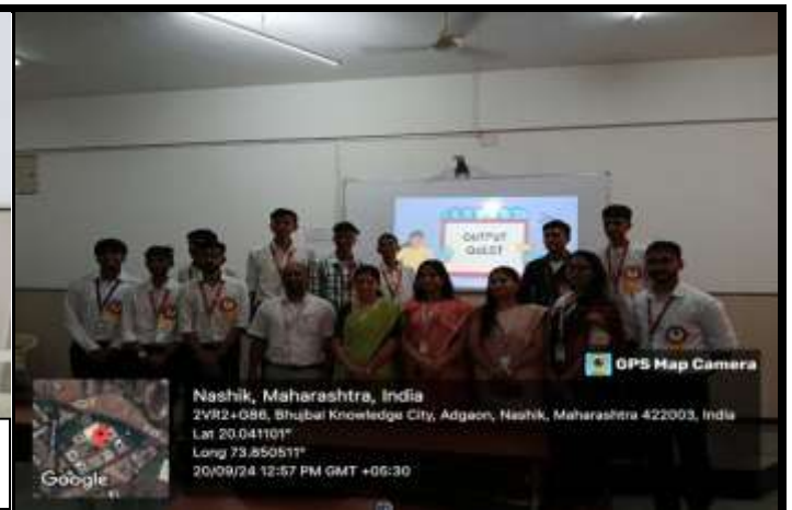
Nashik, Maharashtra, India 2VR2+Q86, Bhujbal Knowledge City, Adgaon, Nashik, Maharashtra 422003, India Lat 20.041101° Long 73.850511° 20/09/24 12:57 PM GMT +05:30