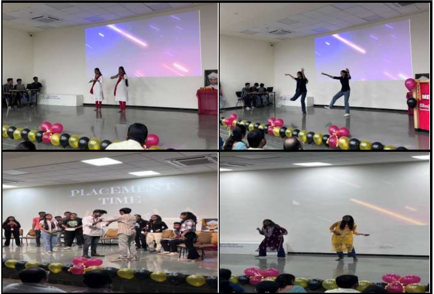
Student performance for Teacher's Day Function 2024