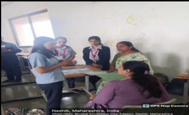
Students Presenting Posture to faculty/expert