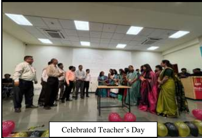
Celebrated Teacher's Day