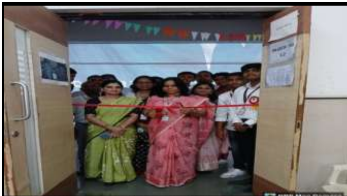
Inauguration of Output Quest event by Dr. with faculty of Computer Dept