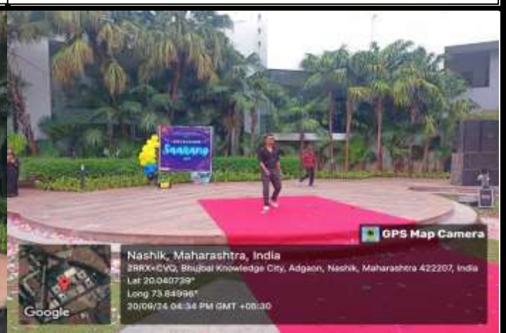
Nashik, Maharashtra, India 2RRXX+CWQ, Bhubal Knowledge City, Adgaon, Nashik, Maharashtra 422207, India Lat: 20.040739° Long: 73.84996° 20/09/24 04:34 PM GMT +05:30