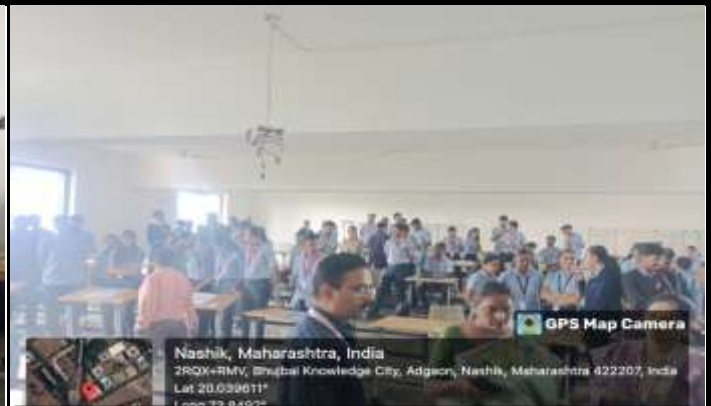
Students attended Posture competition Event.