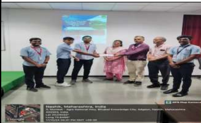
Prize distribution to Winner by Expert