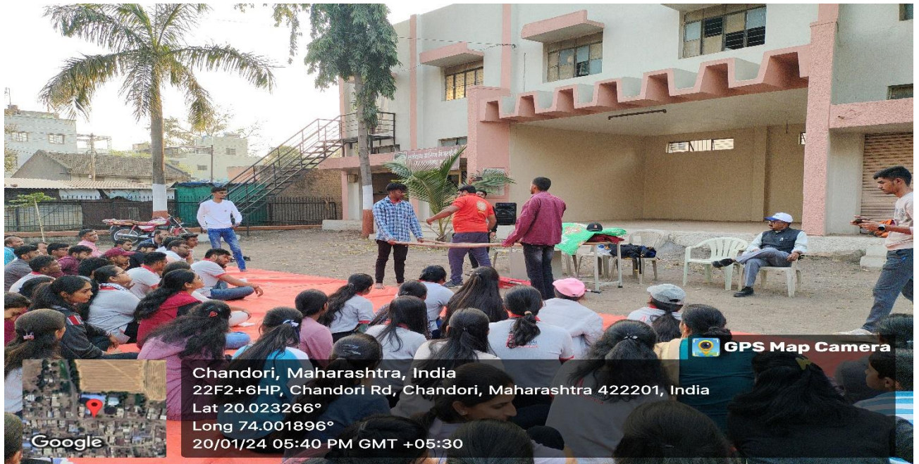
Day 6: Disaster Management session during Flood Session