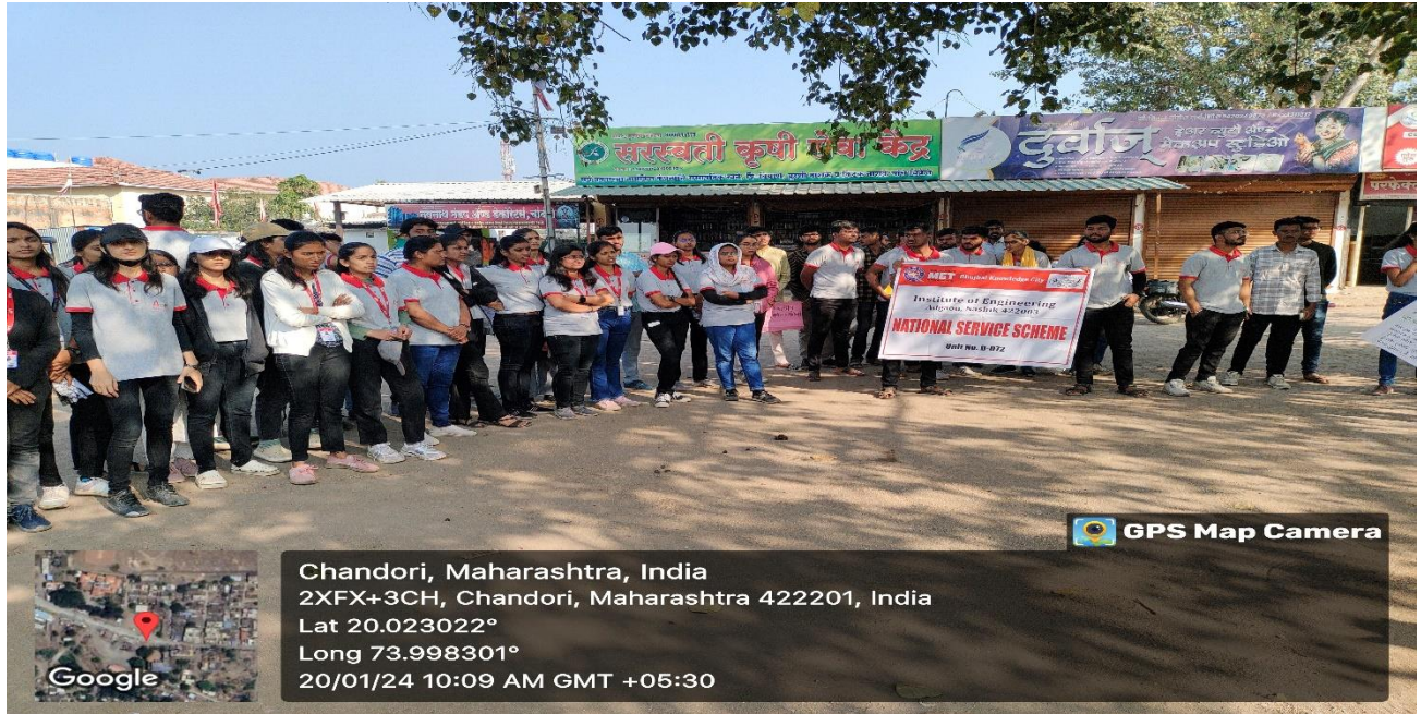
Day 6: Street Play was displayed on the topic Waste Management and Water Conservation.