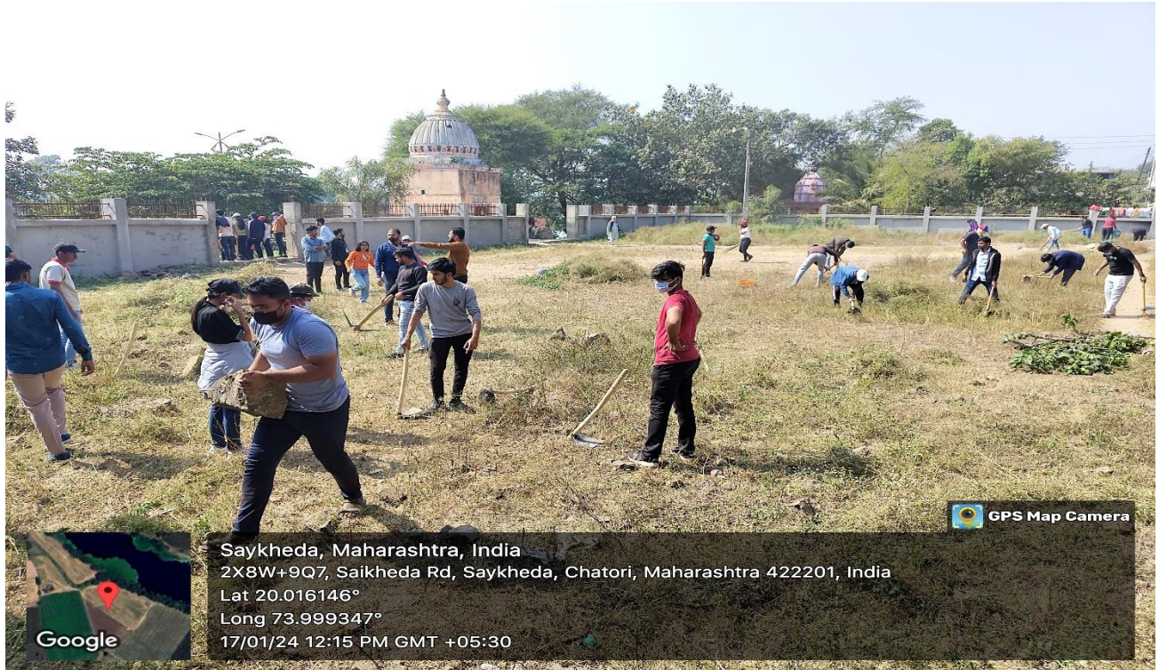
Day 3: Cleanliness Drive carried out in premises of Ram Mandir, Chandori