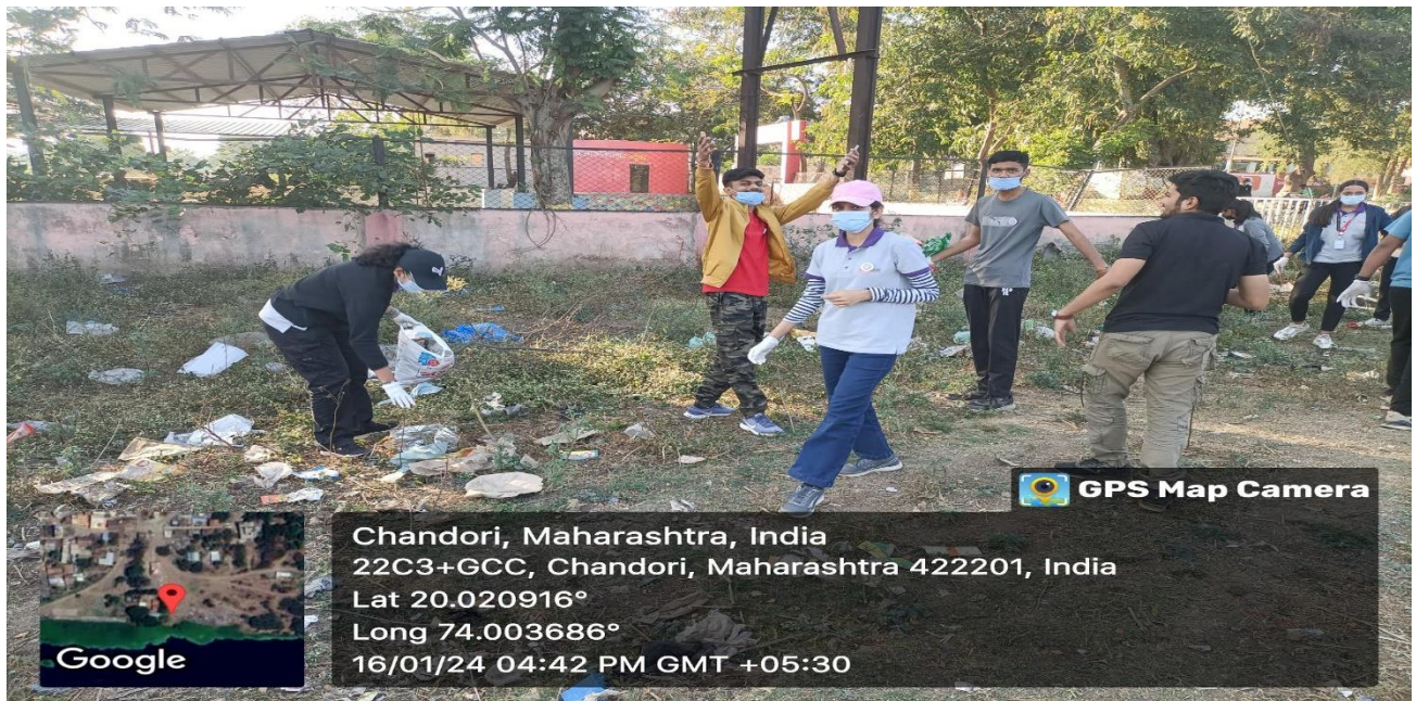
Day 2: Cleanliness drive was carried out along the banks of Godavari River.