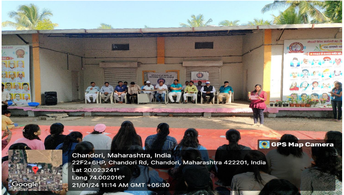
Day 7: Valedictory Session