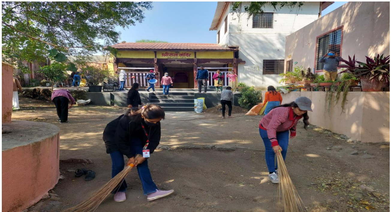
Day 3: Cleanliness drive was organized in Shri Ram Mandir, Chandori