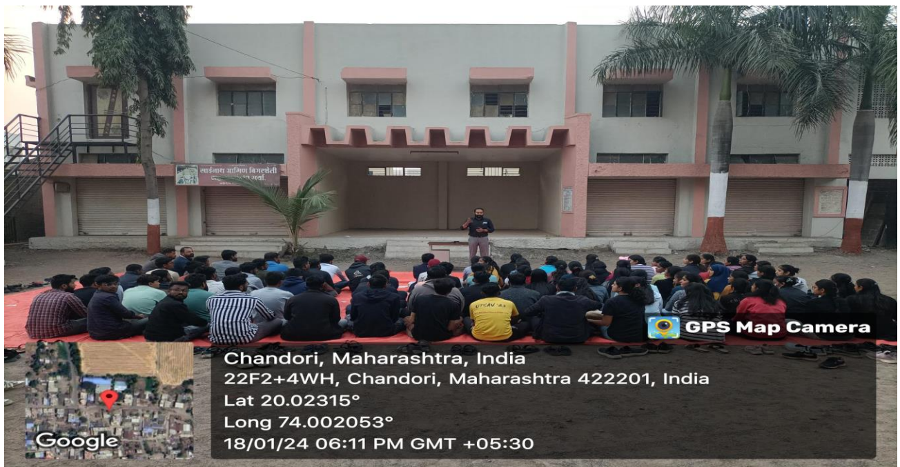
Day 4: Shri Vinayak Rajguru delivered lecture on the topic Development of students and NSS.