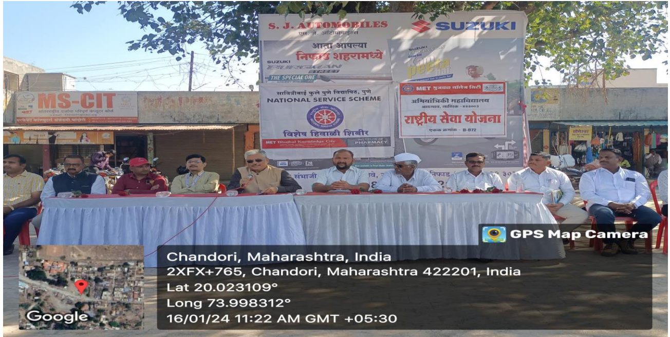
Day 2: Inauguration Session of the Special Winter camp organized at the Main Square of the village.