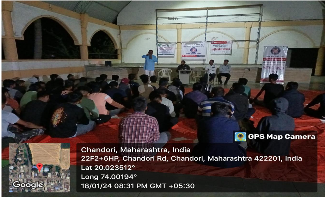
Day 4: Shri Padmakar Morade delivered a lecture on Personality Development Skills.