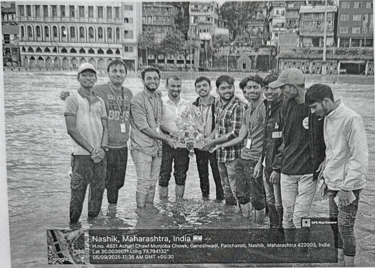
Nashik, Maharashtra, India 🇮🇳 H.no. 4521 Achari Chawl Munjoba Chowk, Ganeshwadi, Panchavati, Nashik, Maharashtra 422003, India Lat 20.003957° Long 73.794132° 06/09/2025 11:36 AM GMT +05:30