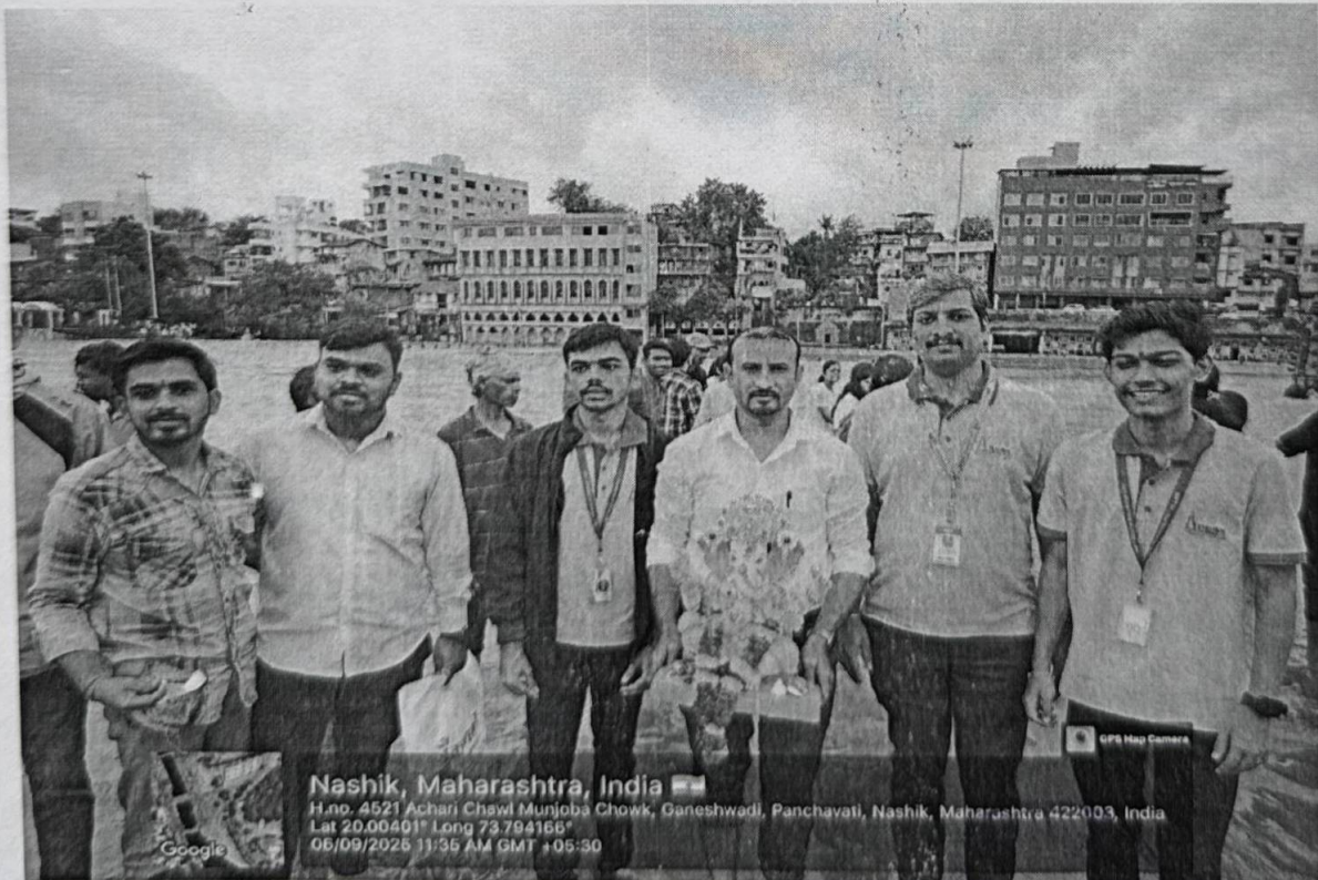
Nashik, Maharashtra, India 🇮🇳 H.no. 4521 Achari Chawl Munjoba Chowk, Ganeshwadi, Panchavati, Nashik, Maharashtra 422003, India Lat 20.00401° Long 73.794166° 06/09/2025 11:35 AM GMT +05:30