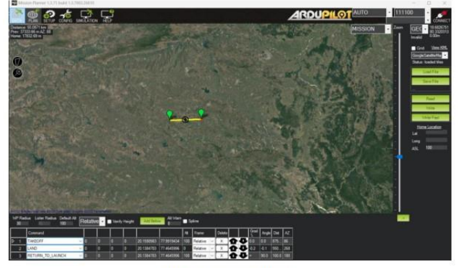
Mission Planner Software

The firmware of an APM quadcopter is the software that runs on the flight controller. It is responsible for interpreting sensor data and providing the necessary control signals to the ESCs to control the drone's movement. The firmware used in an APM quadcopter is based on the ArduPilot software platform, which is opensource and has a large community of developers contributing to its development