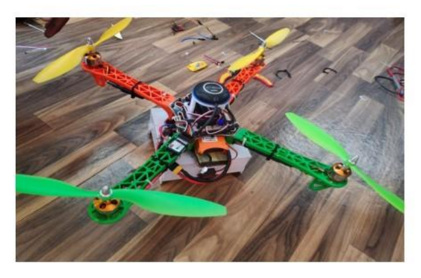
Fig: Drone Top view