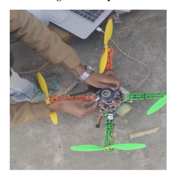
Fig: Fitting the drone component