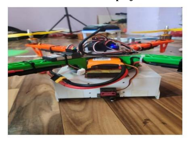
Fig: Drone side view

IJIRMPS230235 Website: <a href="www.ijirmps.org">www.ijirmps.org</a> Email: editor@ijirmps.org 4