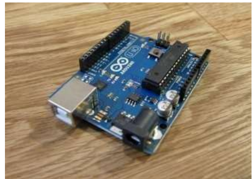
Fig. Arduino Board

Uno is a microcontroller board based on the ATmega328 (datasheet). It has 14 digital input/output pins (of which 6 can be used as PWM outputs), 6 analog inputs, a 16 MHz crystal oscillator, a USB connection, a power jack, an ICSP header, and a reset button. It contains everything needed to support the microcontroller; simply connect it to a computer with a USB cable or power it with an AC-to-DC adapter or battery to get started. The Uno differs from all preceding boards in that it does not use the USB-to-serial driver chip.